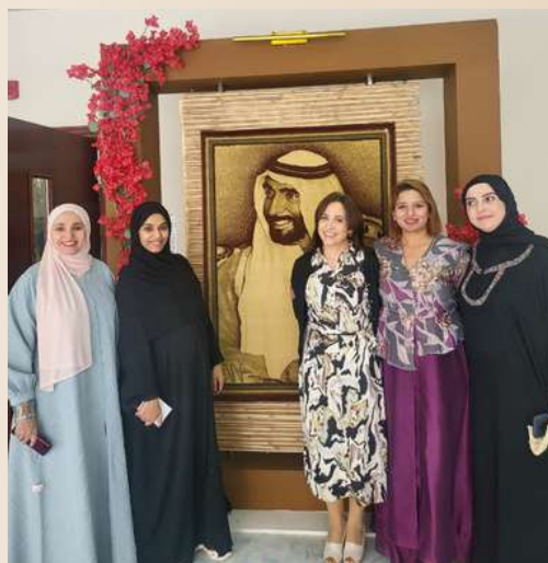
Al Ain campus