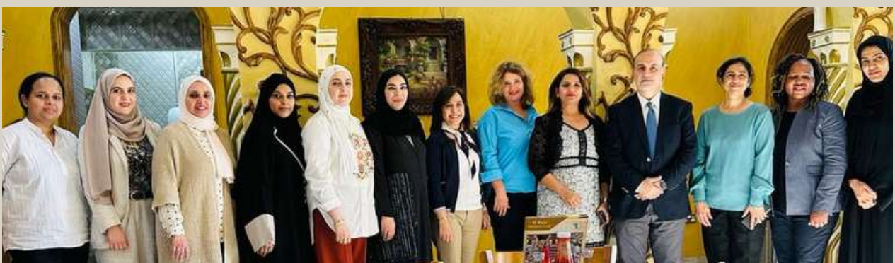
AUH & AAN staff celebrating the end of semester