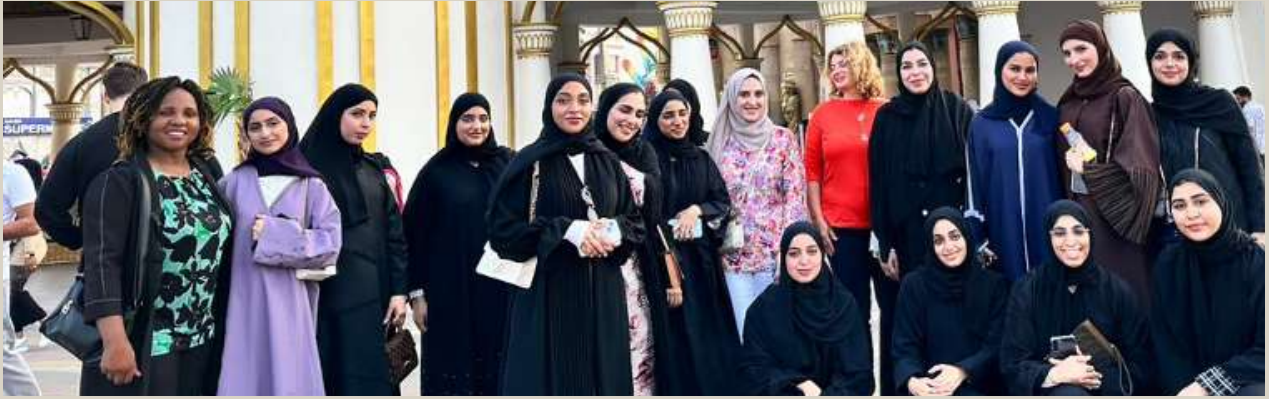
Global Village trip

The purpose of team building activities at physiotherapy department is to connect staff and students in enjoyable experience and to increase trust, improve communication and collaboration.